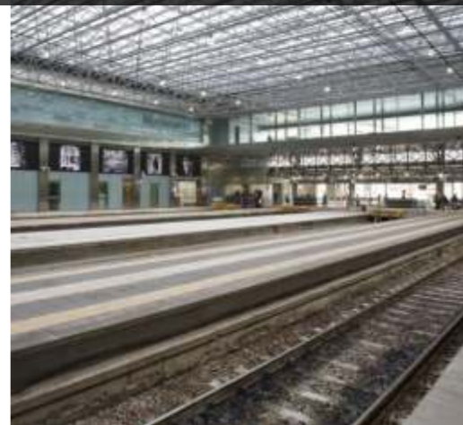
METROPOLITANA DI MILANO - LINEA 4 Milan, Italy

TECNOSISTEM SpA provides a full range of engineering services required by our clients. We meet the need for flexibility often required by the market, offering the best working procedures on all occasions: • on site consulting services; • on site work-package execution; • off-site work-package execution; • off-site work-package execution with an on-site representative. Our ability to work with companies involved in different industrial sectors over the years allows us to propose very convenient contractual conditions to our clients: this is the result of our capability to identify and use the 'best practices' acquired during our long history.